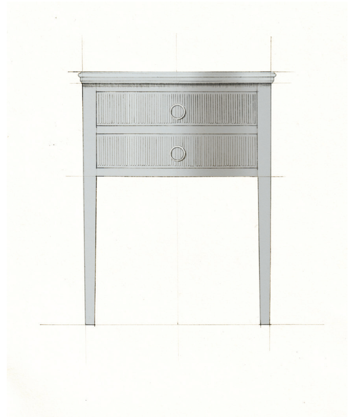
JS EDITIONS BOWFRONT BEDSIDE / TWO DRAWER FRONT ELEVATION

This item is made to order. As standard the dimensions are as above but these can be customised. Available in any of our standard finishes or custom finished to order.