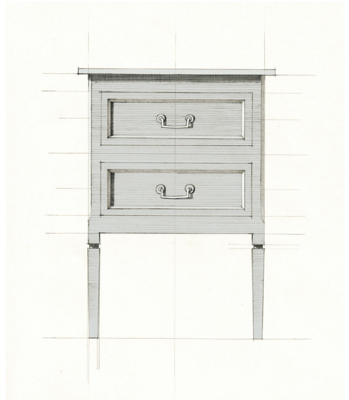
JS EDITIONS DIRECTOIRE BEDSIDE / TWO DRAWER FRONT ELEVATION

This item is made to order. Available in any of our standard finishes or custom finished to order.